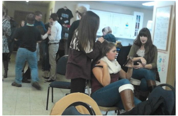
Superbowl 2015 at the SRYC

The SRYC is open all school year long for grades 6-12 every Friday and Saturday night from 6:30-9:00 PM and is always free for them to attend. If only it were free for us to operate! We run everything we do from the donations of people just like you who care about keeping our kids in a safe, fun place where they are also learning. Each donation not only helps us to keep our facilities running and provides an event each night, but also enables us to give them special opportunities and events, such as our Caregiver's Day and Art and Music Festivals. Would you consider helping us to continue this vital and one of a kind organization in Morrisville?