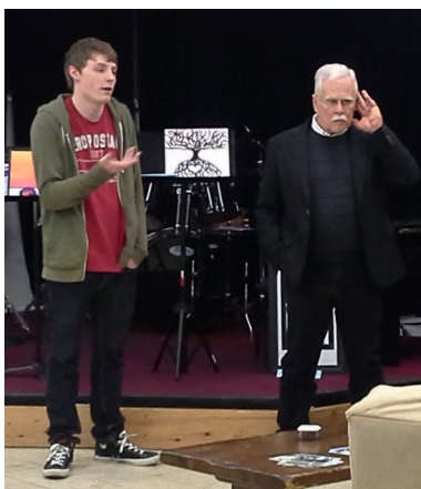
Top Right: One of last year's winners

on our back kitchen wall, which will greatly increase our storage space and maximize the potential for that area. The event is open to the public and we are especially excited to see you there!