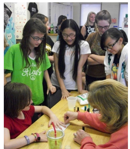
A spa night at the SRYC

Volunteering is a great way to support the youth center in a different way! Time is a valuable commodity that not everyone has, but we must staff the youth center fully in order to open our doors. If you would like to volunteer, but simply don't have the time, a gift of $25 will fill that spot for one night!