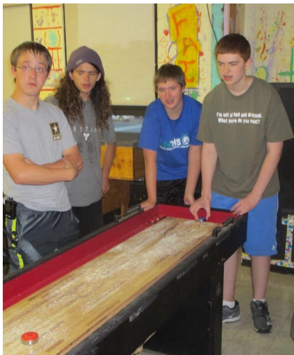
A firefighter hangs out with the youth at our Fall Festival Sept 2015

We kicked off the season with our Fall Festival (see pictures in sidebar!) and had an amazing time, playing fall games, eating fall-themed food and serving the community as a family. We collected teddy bears for the Morrisville First Responders and presented the toys to them on that night. We had over a hundred and fifty in attendance.