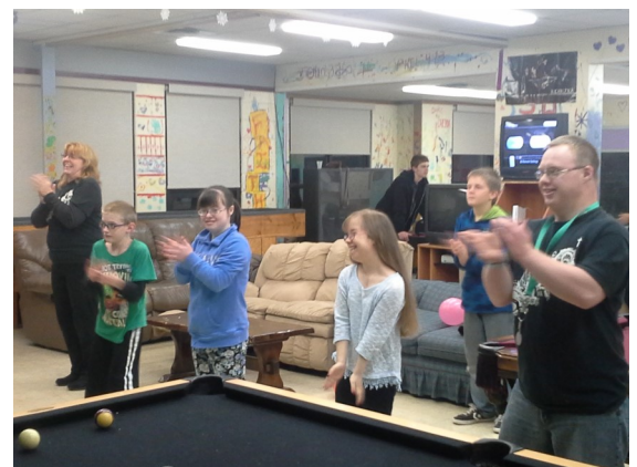
Our Real Friends Night Oct 2015