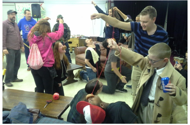
Donut Game at Costume Party Oct 2015

We just had an event at the youth center that had 30 kids. We spread out over the whole church to play one of their favorite games, Gorgon.